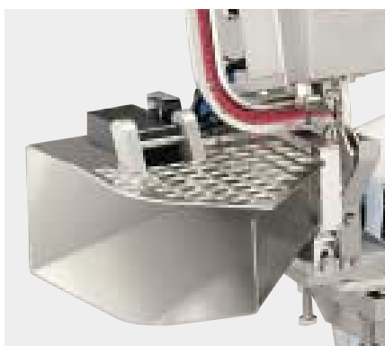
The discharge offers maximum safety and enables a smooth operation.

High performance machine for links of chubs (narrow beef/pork rounds and collagen casings) up to 46+ mm in diameter. Typical products are German Rindswurst, Speckwürste (Czech Republic and Slovakia), Austrian Knackers, Swiss Cervelats.